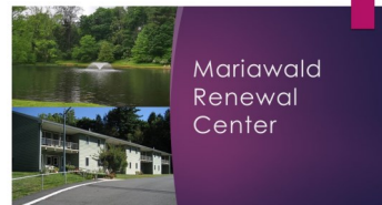
Mariawald Renewal Center

An Eight-Day Preached Retreat for Women Religious/ Sisters & Lay Women – August 2 through August 9, 2024. Mariawald Renewal Center, 1094 Welsh Road, Reading PA 19607.